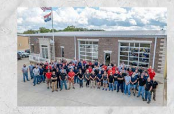
Custom built ambulances crafted by our community to serve yours since 1983